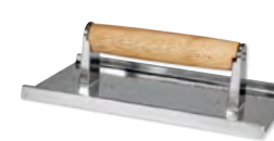
Steak Weight 65418 530 g