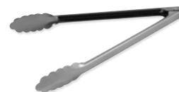
Tongs 65422 24 cm 65423 30 cm