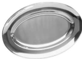
Serving plate 54141 41 x 27 cm