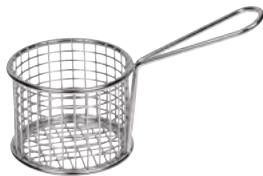
Mini frying basket 54213 Ø 9,5 cm