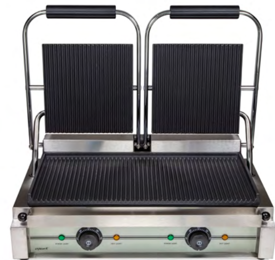
Contact grill double, ribbed 90017 3,6kW/ 230V/1 phase/ 16A