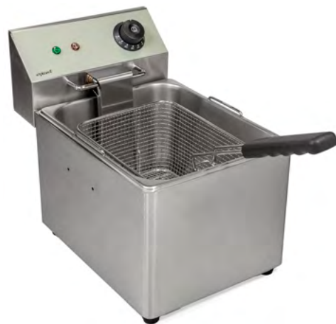
Fryer 90019 1 pool, 8 L

Kitchen appliances are invaluable time saver for all professional kitchens.