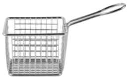
Mini frying basket 54212 10 x 7,5 cm