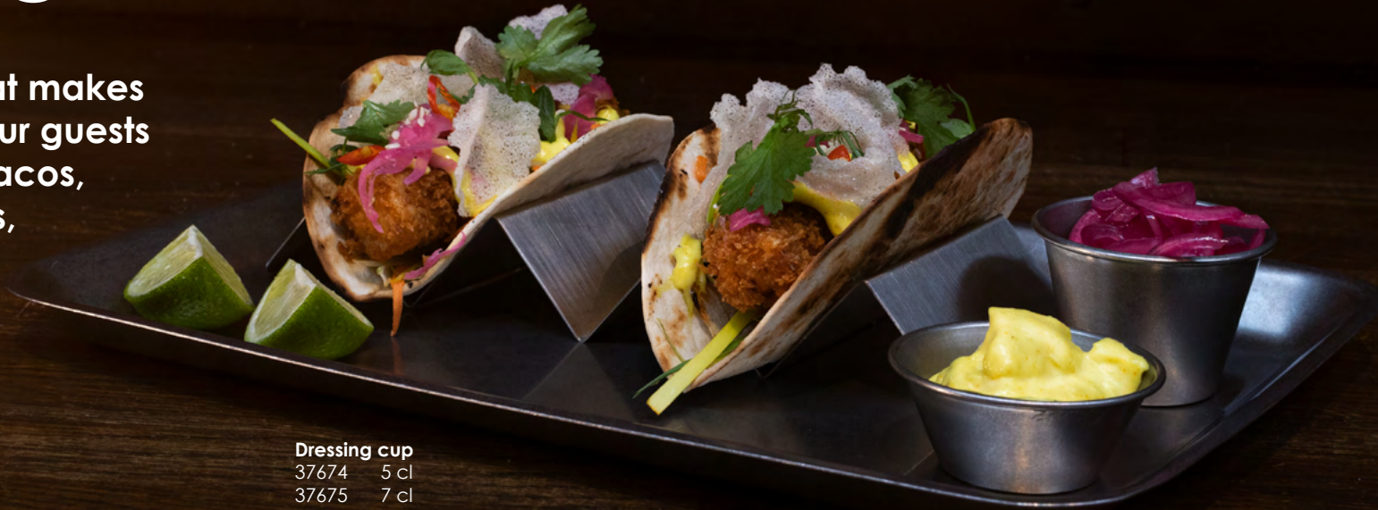
Dressing cup 37674 5 cl 37675 7 cl

We offer baskets, dishes, trays and coasters, all to suit YOUR serving.