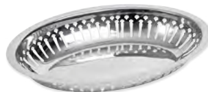
Bread basket 89048 24 x 16 cm 89064 28 x 20 cm