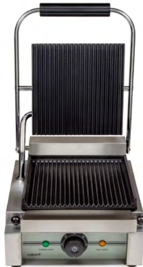
Contact grill, ribbed 90009 1,8kW/ 230V/ 1phase