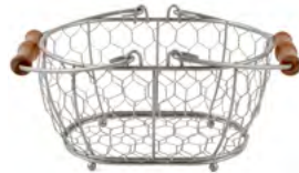
Baked with wooden handle 89061 20 x 15 cm