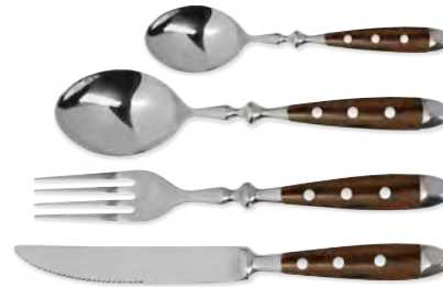
Genua Teaspoon 13354 150 mm