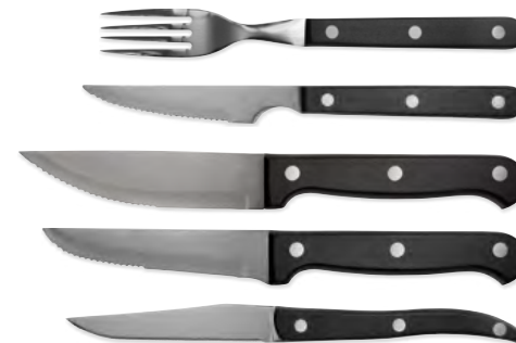
Palermo Steak fork 97732 210 mm