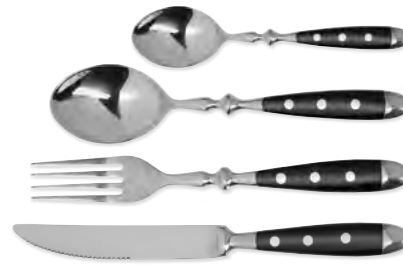
Gourmé Teaspoon PT15TSFE 150 mm