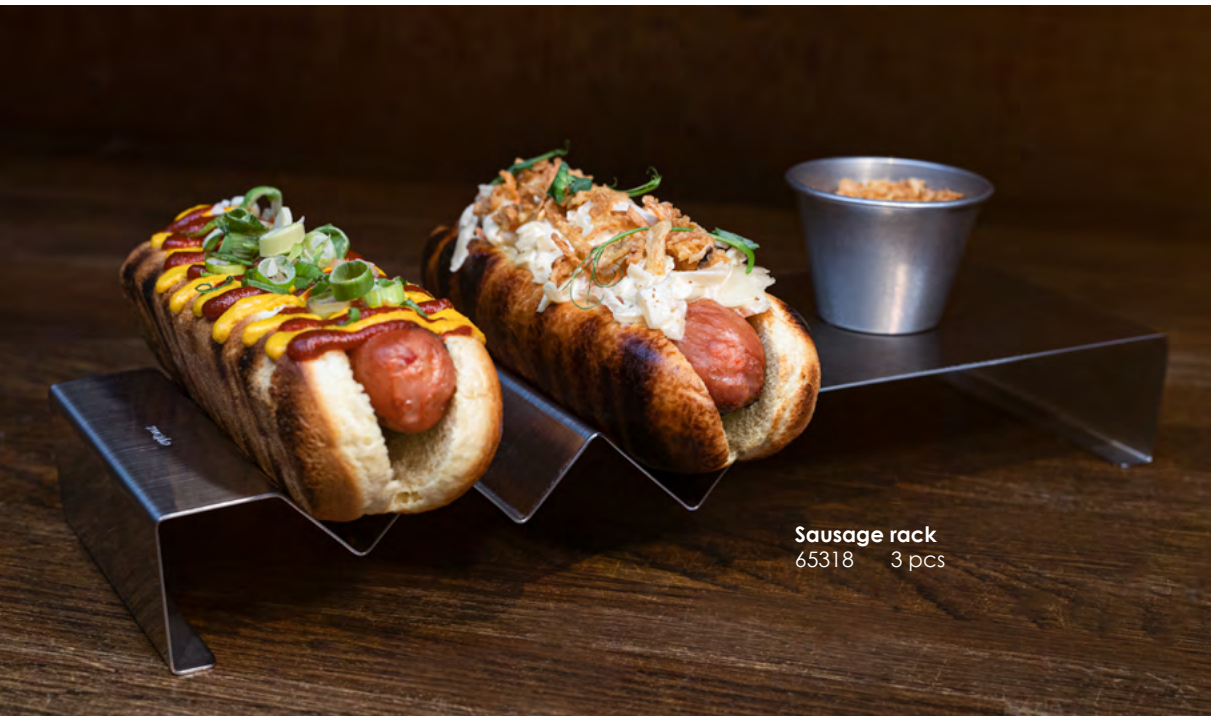
Sausage rack 65318 3 pcs