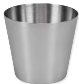
Bucket 37688 360 ml

A trendy serving tray in a vintage look. The matte finish in brushed steel gives a lasting impression and a robust feel. The tray is 1.3 mm thick, which ensures the shape and enables machine washing.