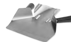
French fries scoop 65419 22,5 cm